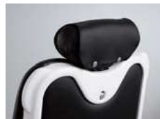
Upholstered Headrest Cover