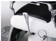
Additional Reclining Lever (Left)