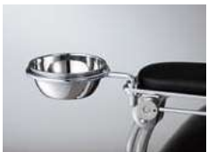
Manicure Bowl / Holder