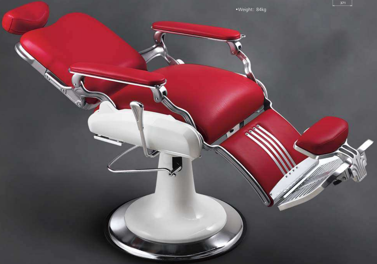
Legacy 90 Barber Chair in Red, Metallic Silver Chair Frame on Hydraulic Base