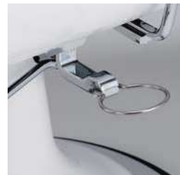
Dryer Holder (Optional in some countries)