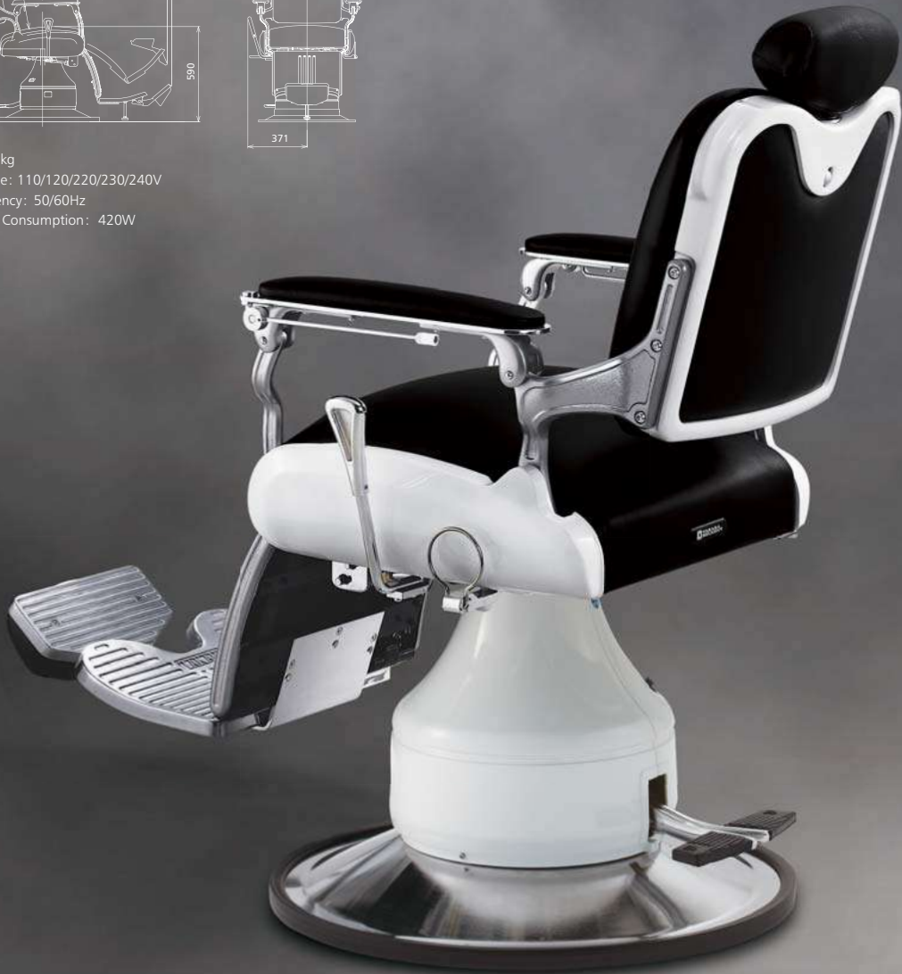
Legacy 90 Barber Chair in Black, White Chair Frame on Motorized Base