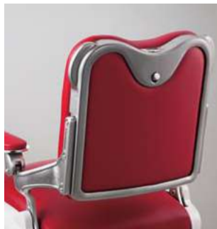
Metallic Silver(Upgrade Option)