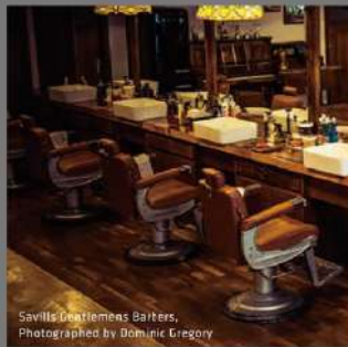
Savills Gentlemen's Barbers