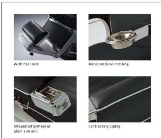
With heel rest