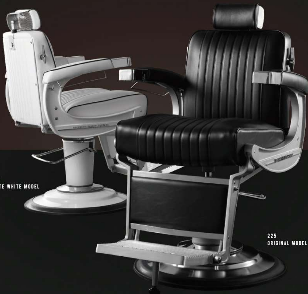
225 ELITE WHITE MODEL

but it's only Takara Belmont who makes The Real Thing.