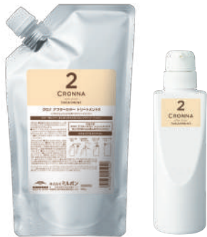
AFTER COLOR TREATMENT 2 600g pack / 450g bottle (salon use pump bottle) (发廊专用瓶装)

含有单宁酸成分，可达到包覆效果与维持秀发的质感。就算修补了发丝内部，蛋白质成分也会从发丝断面流出为课题，更有效地加强了包覆效果。双层的发廊护理步骤，使成分浓度更高，可达到居家护理所无法匹敌的光泽与柔顺感，打造肉眼可辨的极佳效果。