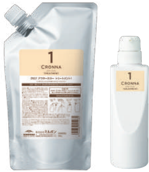
AFTER COLOR TREATMENT 1 600g pack / 450g bottle (salon use pump bottle) (发廊专用瓶装)

Salon treatment and once a week intensive home care kit that prolongs shiny and manageable hair condition after hair coloring. 可维持染色后的光泽与整齐度的发廊护理，及每周使用一次的居家集中护理。