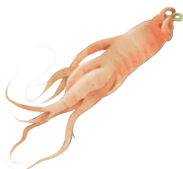
Ginseng extract (Effective ingredients)