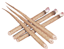
Burdock root extract Formulated in Viege Hair Treatment V (Restoring suppleness and elasticity/Moisturizing) 牛蒡根萃取物 Viege Hair Treatment V 配方 / Viege头发护理V配方。 (恢复柔韧度和弹性/保湿)