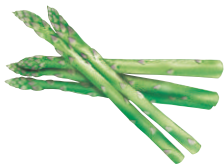
Asparagus stem extract Formulated in Viege Hair Treatment S (Softening and moisturizing) 芦笋茎萃取物 Viege Hair Treatment S 配方 / Viege头发护理S配方 (柔软和保湿)

纳米大小般的皮层强健成分 6 和植物性CMC强健成分 7 能渗透因老化而变得稀疏的发丝，由内至外地强健发丝。备有两种头发护理方案，有效减缓发丝卷曲度，并滋润秀发，让秀发变得更柔软润泽