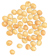
Active isoflavone (Moisturizing)