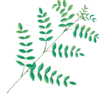
Licorice leaf extract *10 (Moisturizing)