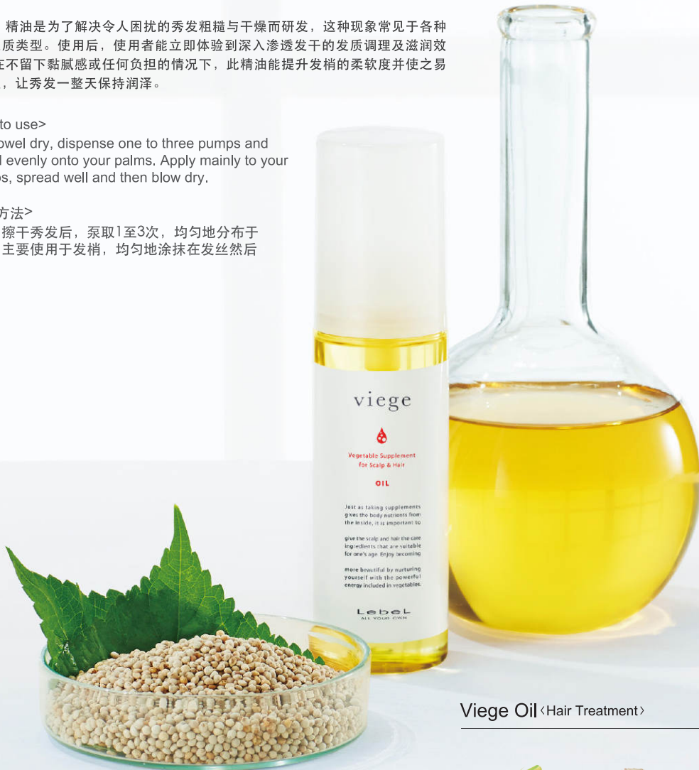
<The images and illustrations are only for illustration purposes of the components in the products>

以毛巾擦干秀发后，泵取1至3次，均匀地分布于掌心。主要使用于发梢，均匀地涂抹在发丝然后吹干。