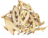
Mulberry root bark extract (Moisturizing)