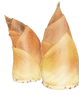
Bamboo root extract *8 (Moisturizing)