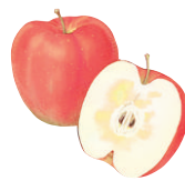
Apple fruit extract (Moisturizing)