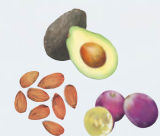
Twelve types of plant oil 7 (CMC reinforcement) 12种植物油 7 <CMC增强剂>