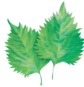
Perilla extract (Moisturizing) 紫苏萃取物 <保湿>