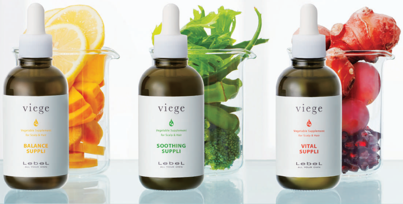
<The images and illustrations are only for illustration purposes of the components in the products>

Viege提供针对不同头皮条件的头皮护理范围。每项疗程的配方是专门针对每位顾客各自的头皮状况而量身打造。每种补充剂的营养成份可渗透头皮进行调理以营造健康的头皮。