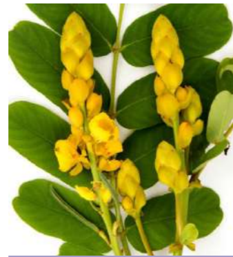
CANDLE BUSH EXTRACT 蠟燭花萃取