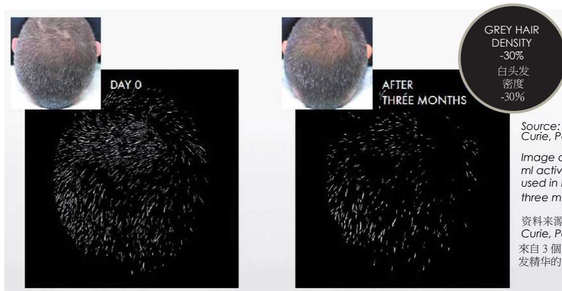
Image analysis of the top of a head before treatment. 图像显示接受疗程前的头部状况。

Image analysis of the top of a head after 3 months treatment. The reduced percentage of grey hair is clearly recognisable after the treatment. 圖像顯示接受療程後三個月的頭部狀況，头发减少的比率显而易见。