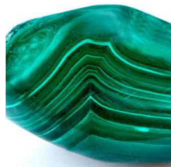
MALACHITE EXTRACT ENERGISER 孔雀石萃取